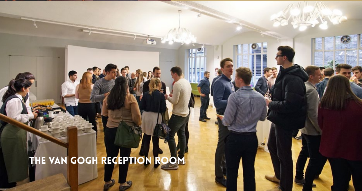
THE VAN GOGH RECEPTION ROOM